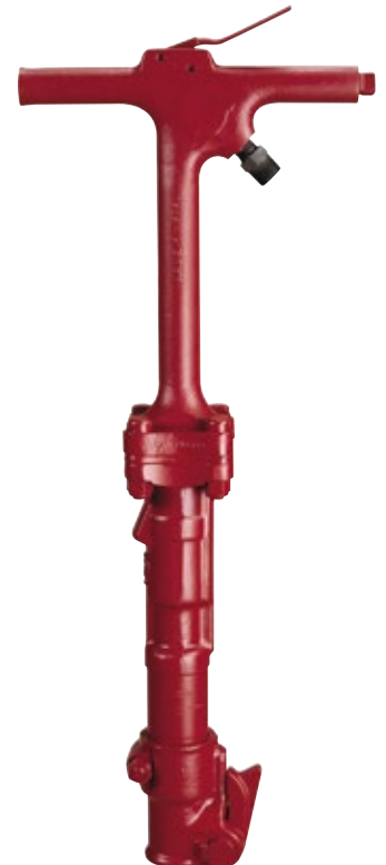
CP 0112 EX

Please Note: Non-muffled tools are not CE-marked and must not be sold for use in the EEA (European Economic Area), i.e. EU plus Norway, Iceland and Lichtenstein.