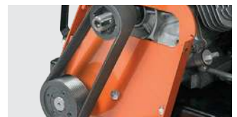
PULLEYS WITH REMOVABLE HUB AND POLY V-BELTS