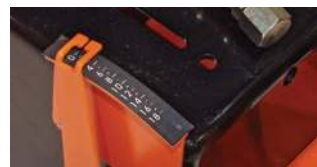
CUT DEPTH INDICATOR