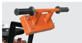
LOW VIBRATION HANDLEBAR