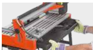
REMOVABLE WATER TRAY