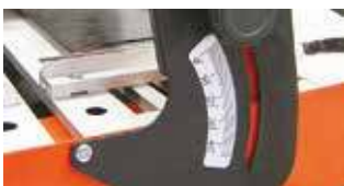
TILTING HEAD (0 TO 45°)