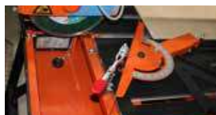
ANGULAR CUTTING GUIDE / RUBBER-COVERED TABLE