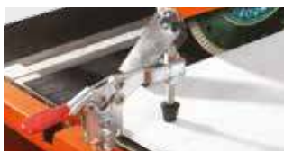
ADJUSTABLE CLAMPS FOR FIXING THE TILES