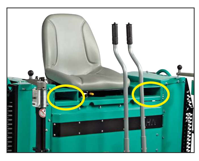
Fork truck pockets built into an ergonomically designed seat frame