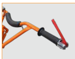
DEAD MAN HANDLE