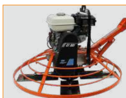
SAFETY GUARD RINGS