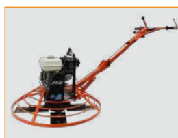
ROBUST AND RELIABLE